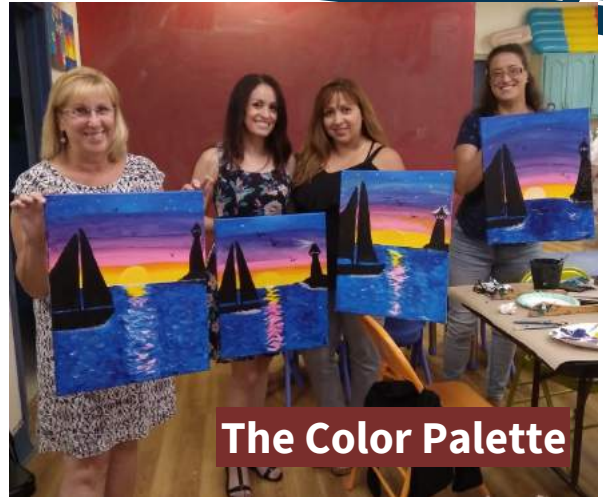
The Color Palette