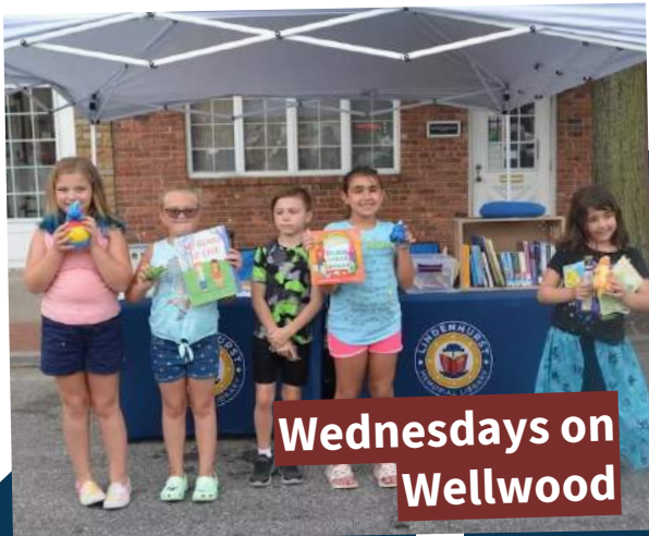
Wednesdays on Wellwood