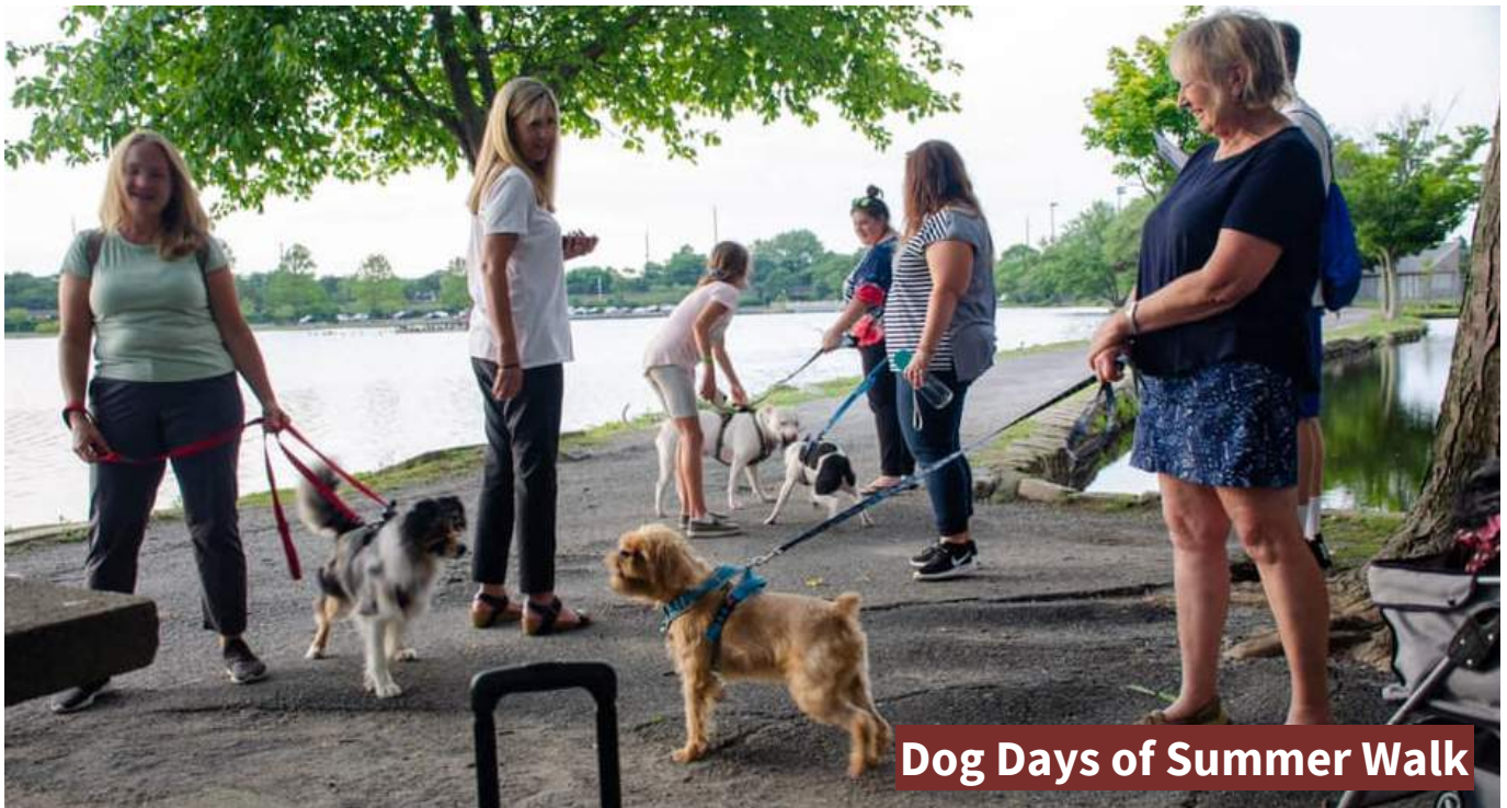
Dog Days of Summer Walk