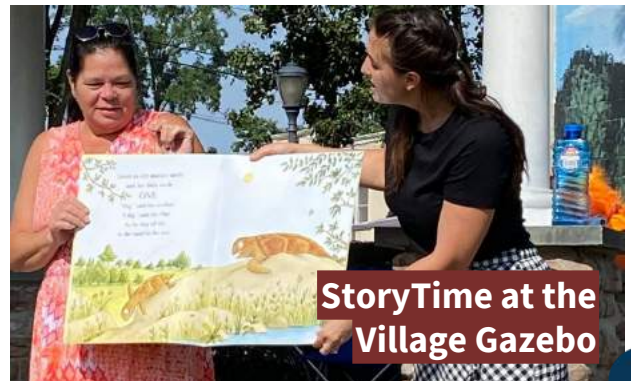
StoryTime at the Village Gazebo