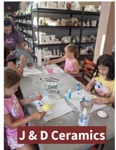
J & D Ceramics