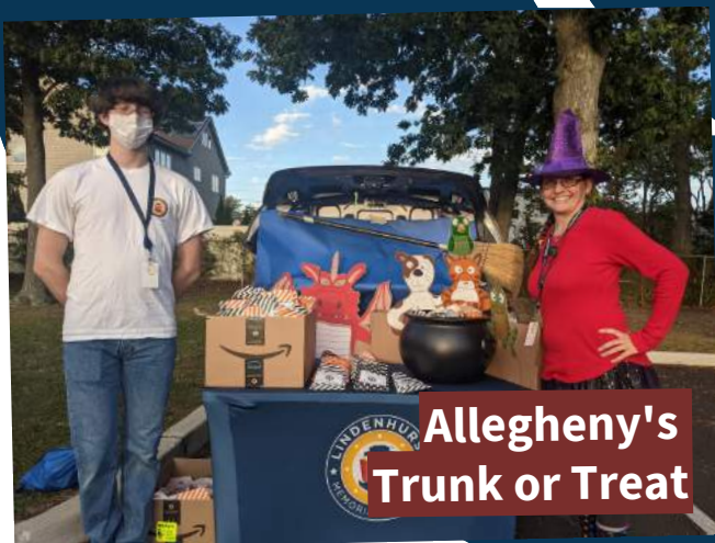
Allegheny's Trick or Trunk