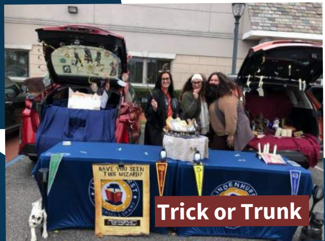
Trick or Trunk