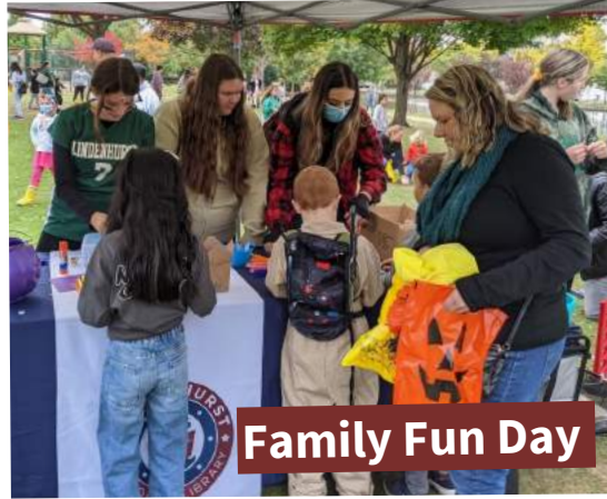
Family Fun Day