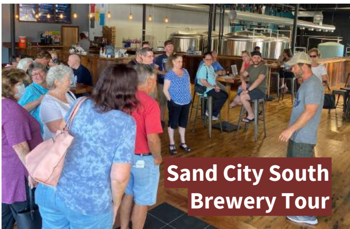
Sand City South Brewery Tour