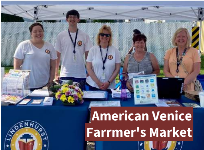
American Venice Farmer's Market