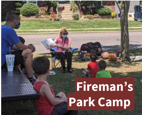
Fireman's Park Camp