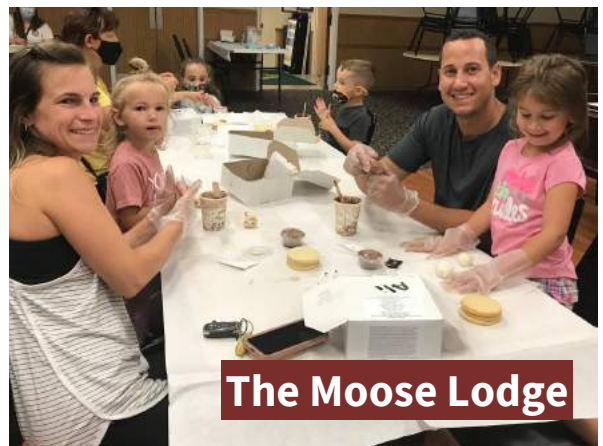
The Moose Lodge